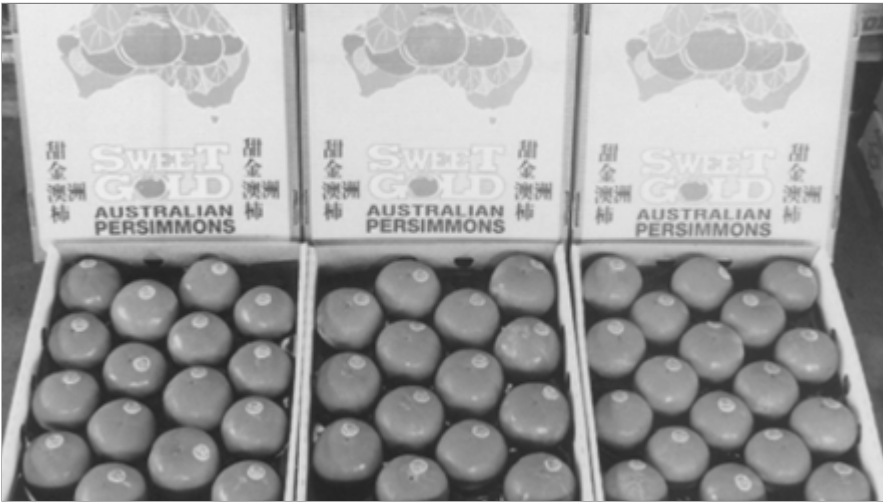
5 가 (Fuyu )