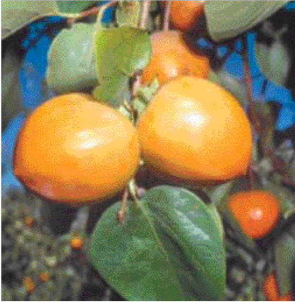
7 Astringent (