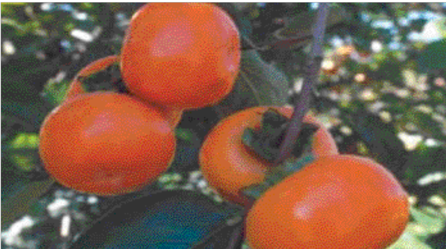
6 Astringent Flat Seedless (New South Wales )